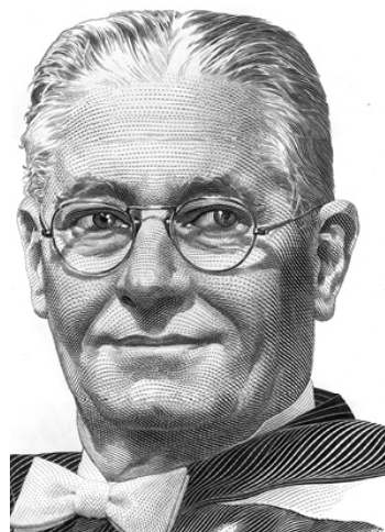
Figure 2. Dr. Howard Florey (1898-1968). Developing "Penicillin" (Australian $50 Note).

After Domagk's work, the majority of anti-bacterial drugs were developed from natural (bacterial/fungal) products called antibiotics. One of the first effective antibiotics was "Penicillin" which was discovered by Alexander Fleming (1881-1955) and further developed by Howard Florey (Figure 2) and Ernst Chain (1906-1979). These three scientists shared the 1945 Nobel Prize in Medicine (4).