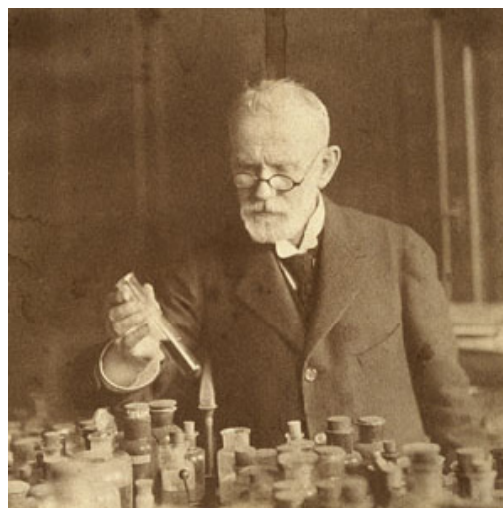
Figure 1. Dr. Paul Ehrlich (1854-1915). Father of Chemotherapy discovering "Salvarsan".

He was born on March 14, 1854, between Jewish parents in Silesia then a part of Germany, but now in the territory of Poland. In terms of science, the most influential member of his family was his elder cousin Carl Weigert who introduced the young Ehrlich to histochemistry, staining of tissue specimens by aniline dyes. Through this histochemistry, Ehrlich learned that each chemical shows a specific affinity for a certain tissue or bacteria. Since then he became obsessed with dye-staining for the rest of his life. Soon he developed a new concept, no reaction without binding. Based on